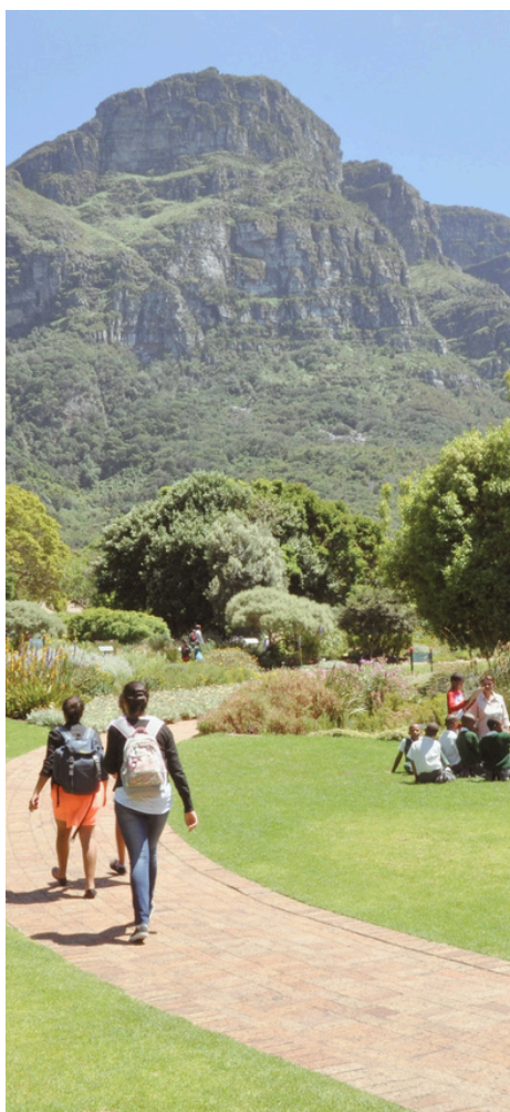
Photos of Kirstenbosch National Botanical Garden set against the backdrop of Cape Town's Table Mountain, courtesy of Kirstenbosch National Botanical Garden.