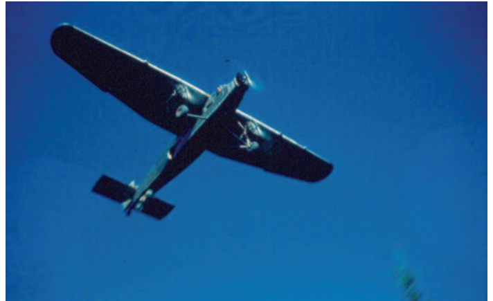
Figure 2. Flying Ford Trimotor. Note propellers on each wing and nose of plane. Photo credit: Image 4352 from Bud Moore's film collection.