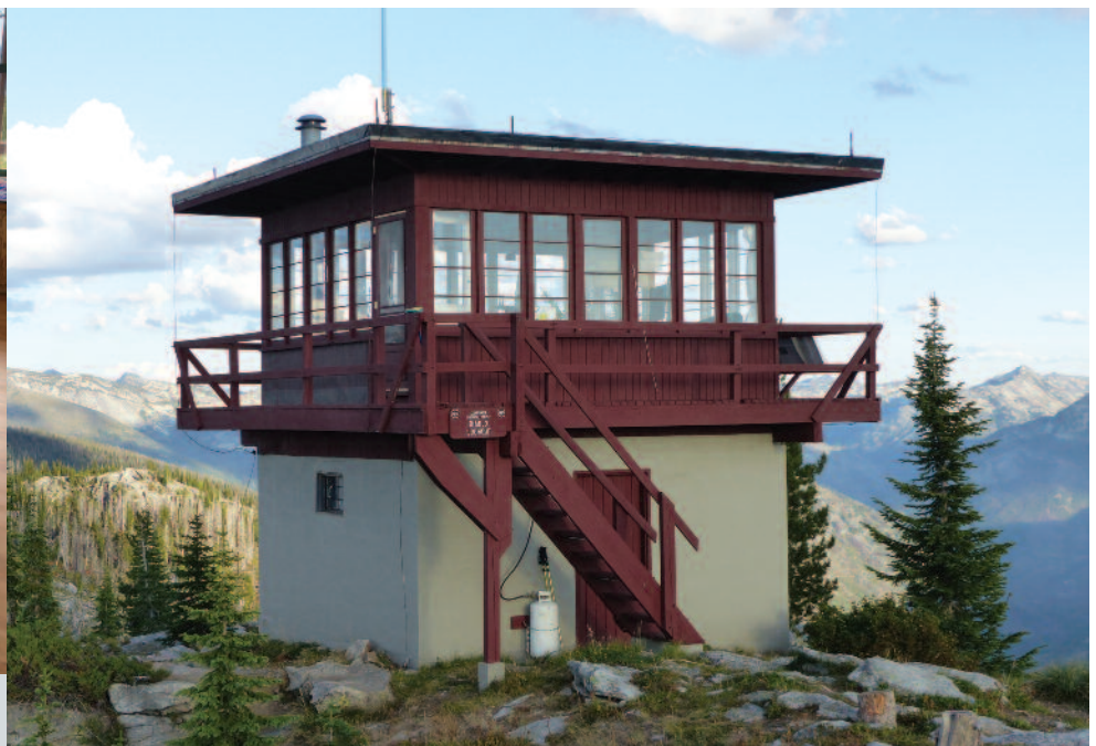
Figure 5. Exterior view of Diablo Mountain Lookout.

One document entitled "Diablo in a Nutshell" describes