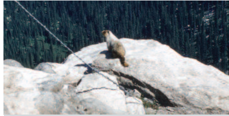
Figure 8. Hoary marmot sunning on rocky ledge below Diablo Mountain Lookout.

There is a lot to do on a lookout and this includes repairs from time to time that result from animals such as rats, chipmunks, and hoary marmots that live in rocky areas around the lookout (Figures 8, 9, 10), chewing on