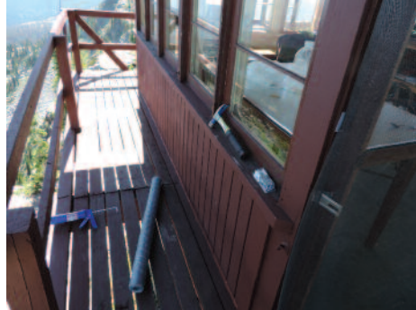
Figure 10. Work detail fixing animal damage to siding around catwalk in 2015 on Diablo Mountain Lookout.

wooden structures such as siding. Recent construction projects have added a new out-house (Figure 11).