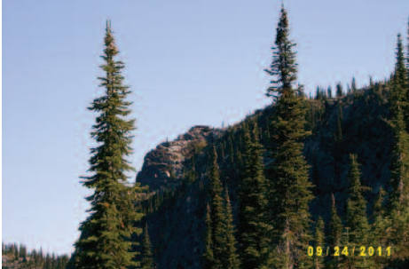
Figure 7. Diablo Mountain Lookout view from trail below. Note lofty rocky outcrop where lookout is located.

a typical day on Diablo Mountain Lookout from sunrise to sunset. Staffing hours are from 08:30 AM until 5:00 PM and involve in part maintaining radio usage, weather reports (rainfall and relative humidity), and safety issues that always follow a safety-first emphasis, especially since the lookout is a ground station on a cliff precipice. The drop off on the north side is a 500-foot fall (Figure 7). Stormy nights with