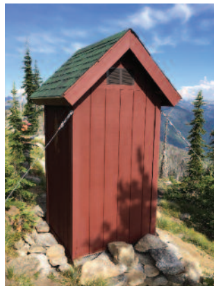
Figure 11. Out-house recently constructed from a kit packed in to Diablo Mountain Lookout.

Additional lookout activities and duties include staying up all night during stormy weather recording lightning strikes and scanning for smokes the next morning and all day when the higher temperatures stoke the fire in dead snags or in needle litter on the forest floor. Onsite lookout activity involved a water-haul by human back pack from a spring about one mile down trail until it stops flowing later in summer.