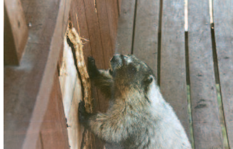
Figure 9. Hoary marmot, a huge bulky ground squirrel ( Marmota caligata ), on catwalk chewing Diablo Mountain Lookout siding, photo by Steve Kalling.