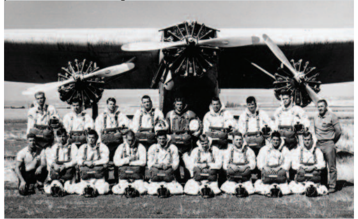
Figure 3. Ground based Ford Trimotor with smokejumpers.