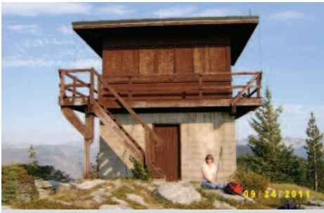
Figure 6. Diablo Mountain Lookout photo by Bill Moore taken September 24, 2012 standing on the west side looking east. Bill's daughter Kris at base with backpack after hike.

a typical day on Diablo Mountain Lookout from sunrise to sunset. Staffing hours are from 08:30 AM until 5:00 PM and involve in part maintaining radio usage, weather reports (rainfall and relative humidity), and safety issues that always follow a safety-first emphasis, especially since the lookout is a ground station on a cliff precipice. The drop off on the north side is a 500-foot fall (Figure 7). Stormy nights with