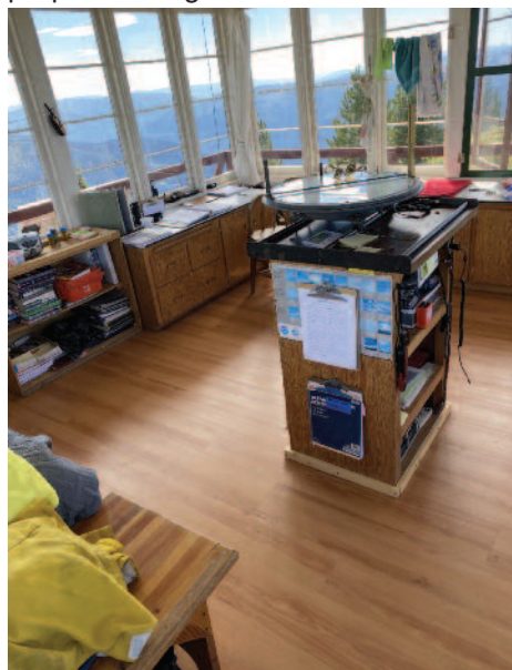
Figure 4. Interior view of Diablo Mountain Lookout today features Osborne Fire Finder floor center with table and cabinets around the outer walls.

Centered in the lookout cabin is the Osborne Fire finder (aka Alidade) to accurately locate smokes (Figure 4). The surrounding lookout interior has a bed, cabinets for groceries, table, wood stove and gas range set against the walls to allow unfettered access to the Alidade. A small propane refrigerator is located down in the blockhouse.