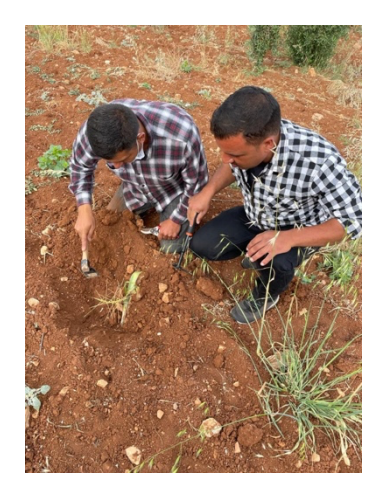
Staff from Royal Botanic Garden Jordan collecting herbarium and genetic tissue vouchers in the field.