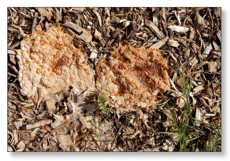
Figure 6. Two aethalia showing premature drying, shrinkage, and aberrant development due to direct rays of the sun.

observed and collected hundreds of Fuligo septica fruiting bodies, and in every case the plasmodia have been yellow, not white. It is possible that past references to transparent and white plasmodia for this species may have been confused with Mucilago crustacea , another aethalioid myxomycete that has the general appearance of Fuligo septica , but has a transparent to milky-white plasmodium, a crystalline calcium carbonate cortex, and different spore ornamentation. Fuligo septica is a common and cosmopolitan species found worldwide; however, it is possible that local environmental conditions could influence plasmodia color which can be quite variable in the myxomycetes. These fruiting bodies sometimes persist for several weeks if left undisturbed.