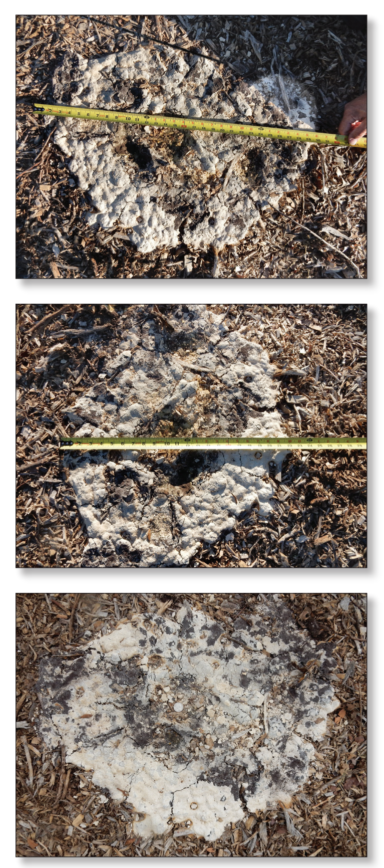
Figure 3. A. World record Fuligo septica aethalium (fruiting body) showing length of 30 in and pancake shape. B. Same specimen showing width of 22 in. C. Same specimen two days later (April 8) with more weathering and exposure of black spore mass and breaking up of cortex (scale = George Washington Head quarter = 1 in).

featured in the science fiction film The Blob released in 1958 starring Steve McQueen in his film debut. This jelly-like blob comes from outer space via a meteorite that falls to earth and then consumes people, getting bigger and bigger until it is finally controlled by freezing and transferring it to the Arctic (Keller and Everhart, 2010).