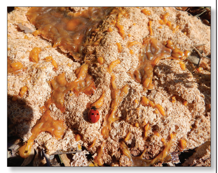
Figure 5. Close-up of prematurely dried aethalium surface showing sclerotized plasmodial remnants and presence of Coccinella septempunctata (the seven-spotted ladybird beetle).

Figure 4. Aethalium with bark mulch fragment, living grass, and portion of yellow plasmodium included in fruiting body formation.