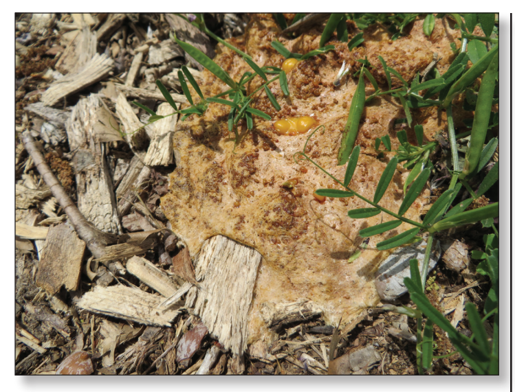
Figure 4. Aethalium with bark mulch fragment, living grass, and portion of yellow plasmodium included in fruiting body formation.