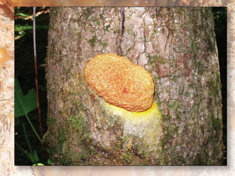
Figure 7. Fuligo septica aethalia that have formed 3 ft above ground level on the bark surface of a living sweetgum tree at a separate site in Great Smoky Mountains National Park. The plasmodium had left a clear trail from ground leaf litter as it migrated up the bark surface.

the spores. This same habitat, such as bark mulch around trees with Fuligo septica aethalia, has been repeated many times in many places (HWK, pers. obs.).