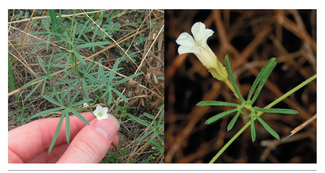
Fig. 2. Photographs of Ipomoea edwardsensis flower (left from Nesom FW99 and O'Kennon).