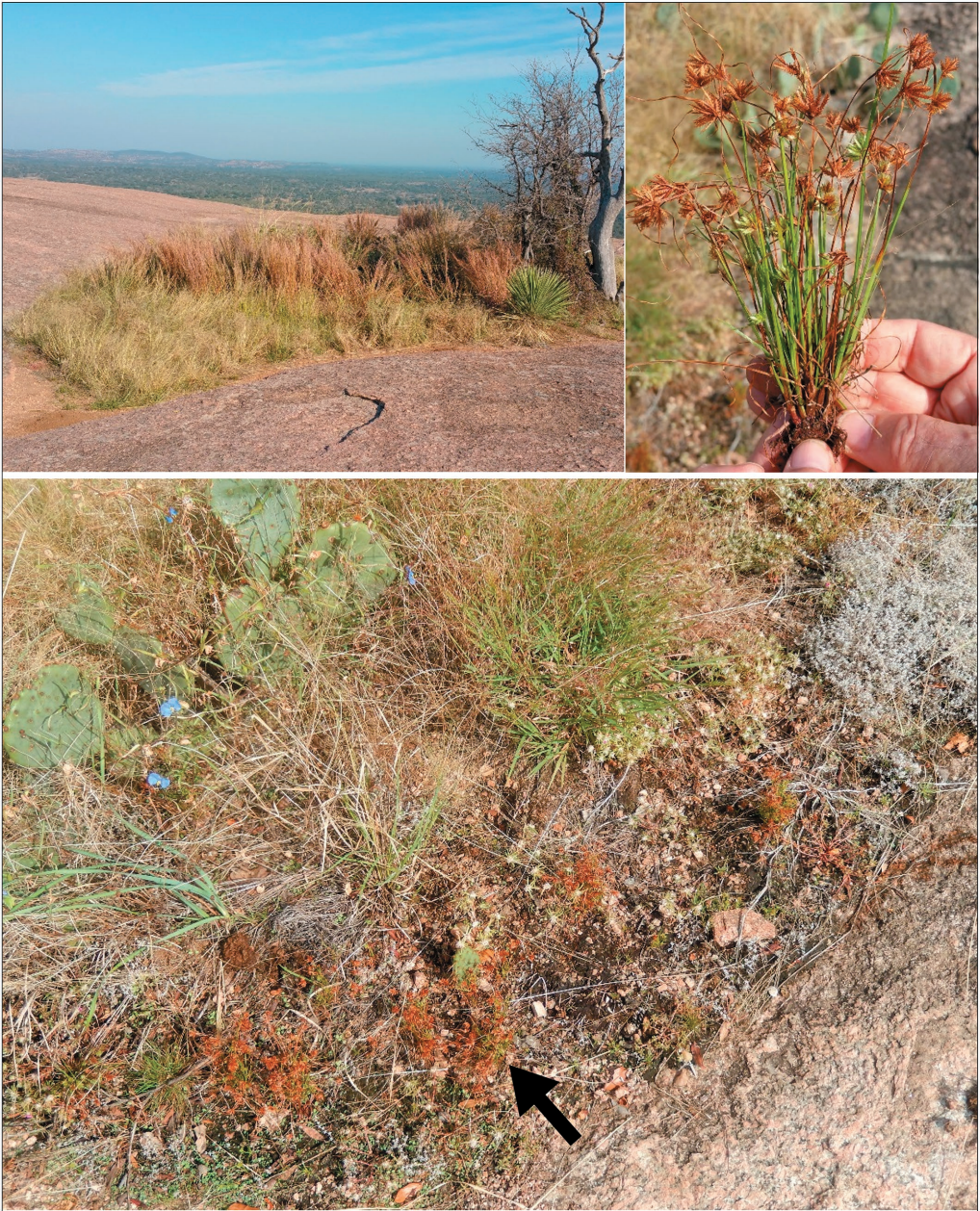
FIG. 3. Images of C. granitophilus and its habitat at Enchanted Rock State Natural Area. Top left: vernal pool on summit of Enchanted Rock; top right: image of plant; bottom: C. granitophilus growing in shallow soil near edge of granite rock.