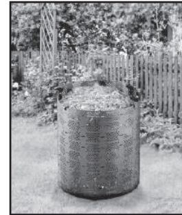
Attendance both days required to receive compost bin.

Mail Checks to: Fort Worth Botanic Garden Education Office 3220 Botanic Garden Blvd. Fort Worth, TX 76107